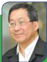
Dato' Dr. Ken Yeang, 2015

“Green design not an utopian pursuit - because utopian implies a dream, a speculation about what the ideal future. It is about today - the present state of environmental devastation and climate change must be addressed here and now, otherwise this millennium could be our last. Green design is about biointegration – biointegration of everything that we make (and not just buildings but all artifacts) and that we do on the natural environment in a seamless and benign way. If we are able to achieve this, then there will be no environmental issues whatsoever. This then is the challenge that we must confront and address”.